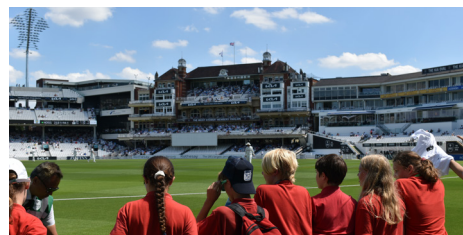
Schools Day during the County Championship match between Surrey and Durham at the Kia Oval on 30 June 2025.

The Surrey Cricket Foundation continued to advance its mission of making cricket more accessible, inclusive, and inspiring for people of all backgrounds and abilities. Central to this work is a commitment to breaking down barriers to participation and ensuring the game reflects the diversity of the communities it serves. During the year, 546 new coaches were trained, many from underrepresented groups, helping to build a more inclusive workforce and create welcoming environments for participants across the recreational game.